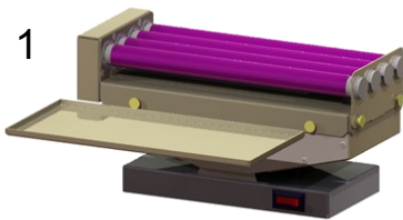
Removable Spill Tray