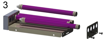
Removable End Plate and Rollers

Contact us or your local KACEY dealer for more information about the Twin Axis Blood Mixer.